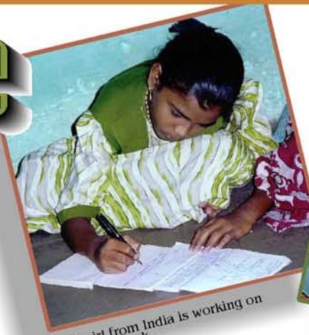
This girl from India is working on her homework.

Summer is over and fall has come. What does that mean? SCHOOL! Children all over the world are going back to school. What is your school like? Do you go to public school, a Christian school? Are you home-schooled? The children in other countries attend many different kinds of schools too. Some go to government schools (or public school), others go to Christian schools. Children of Promise operates free-schools in India and Haiti. Children in our homes as well as poor children in the community may attend. Children in India and Haiti do their work on small chalkboards instead of using pencils and paper. In India, the children sit on the floor to do their work.