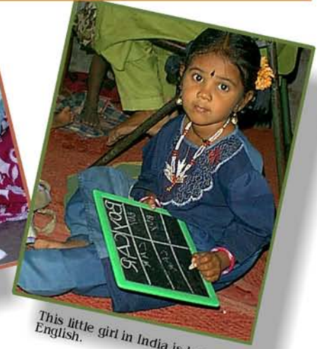
This little girl in India is learning English.