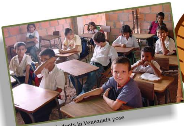
Some students in Venezuela pose for the picture.