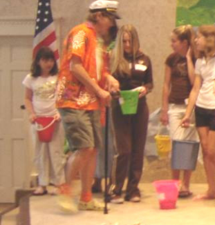
Collecting change for Haiti at Faith Reformed Church VBS.

When children are introduced to the needs of orphaned and destitute children in other countries, they are ready to respond with help. That is what happened at the Vacation Bible Schools of Faith Reformed Church, Midland Park, New Jersey and Evangelical Free Church, Chico, California—from one side of the United States to the other, yet the same compassionate hearts.