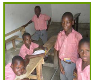
Boys attending school.

in our childrens' homes. Soon after opening, the neighborhood children were given the opportunity to attend for $10 (U.S.) per year, which also includes one meal a day. The school is beginning their fall term and many of the children that previously attended are dropping out because their parents barely have money to buy rice, and certainly none to pay for an education, even at this meager cost. Their choice was made for them. One must survive. Unless help arrives, the literacy of Haiti will continue to plummet and these children will have no hope for a better life. For as little as $10, donors can help feed one poor child of Haiti for one year with academic knowledge, knowledge of the love of Jesus, and wholesome food once a day.