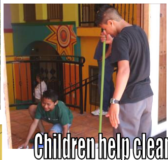
Children help clean