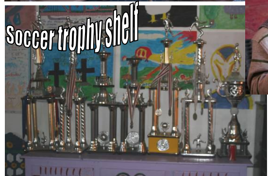
Soccer trophy shelf