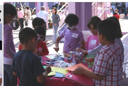
face and picture painting