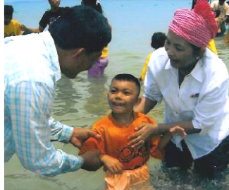
Surrendered to his Savior.