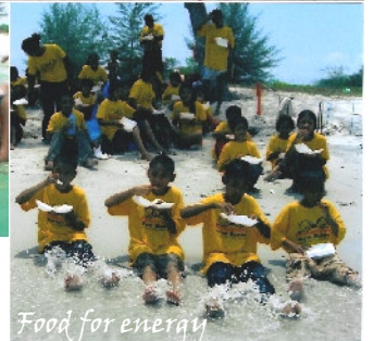
Food for energy