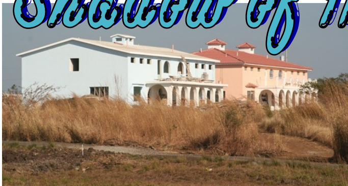
Left—The second home duplex is finished.