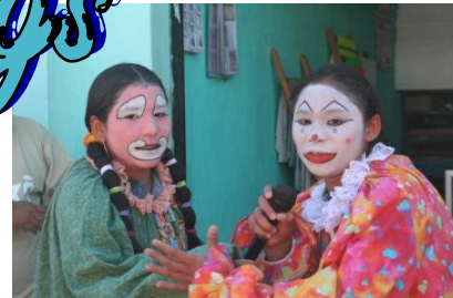
The girls are bringing the love of Jesus to a local nursing home. Precious seniors are filled with joy.