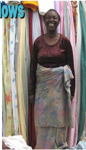
D. R. Congo Widow selling cloth as her micro-enterprise.